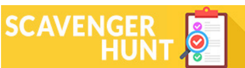
Exhibit Hall Scavenger Hunt - Saturday

This year we are trying something new! Upon your entrance to the Exhibit Hall Saturday morning, each attendee will be given a list of items to scavenge for in the Exhibit Hall. You will have until 5pm to complete the list and enter our drawing for fantastic prizes.