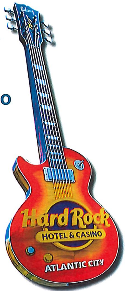
Exhibit spaces available on a first come, first served basis